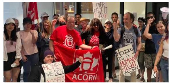
Make Housing Community owned