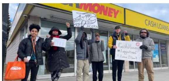
Stop corporate landlords